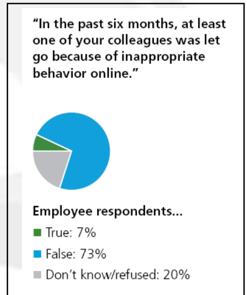
Pie chart 3